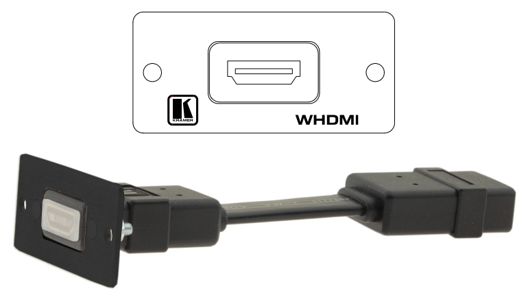
Figure 1: W-HDMI

The W-HDMI is a single-insert wall plate (see Figure 1) with one HDMI connector at the front and a cable and connector at the rear: