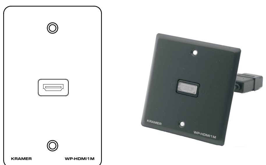
Figure 2: WP-HDMI1M