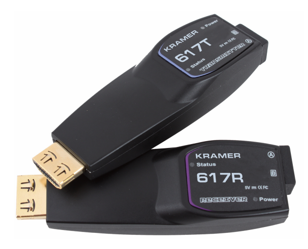
Figure 1: 617T Transmitter and 617R Receiver

Congratulations on purchasing your Kramer 617T and 617R Plug and Play active 4K HDR HDMI Tx/Rx over Extended-Reach Multi-Mode (MM) Fiber Optic cable. 617T and 617R extend signals of up to 4096x2160 @60Hz (4:4:4), over a distance of up to 200m (656ft) without signal scaling or data compression, providing a maximum data rate of 18Gbps. 617T and 617R are easily and securely connected via a 2LC fiber connector and can be powered from the USB connector. Alternatively, 617T only can be powered from the HDMI interface (pin #18).