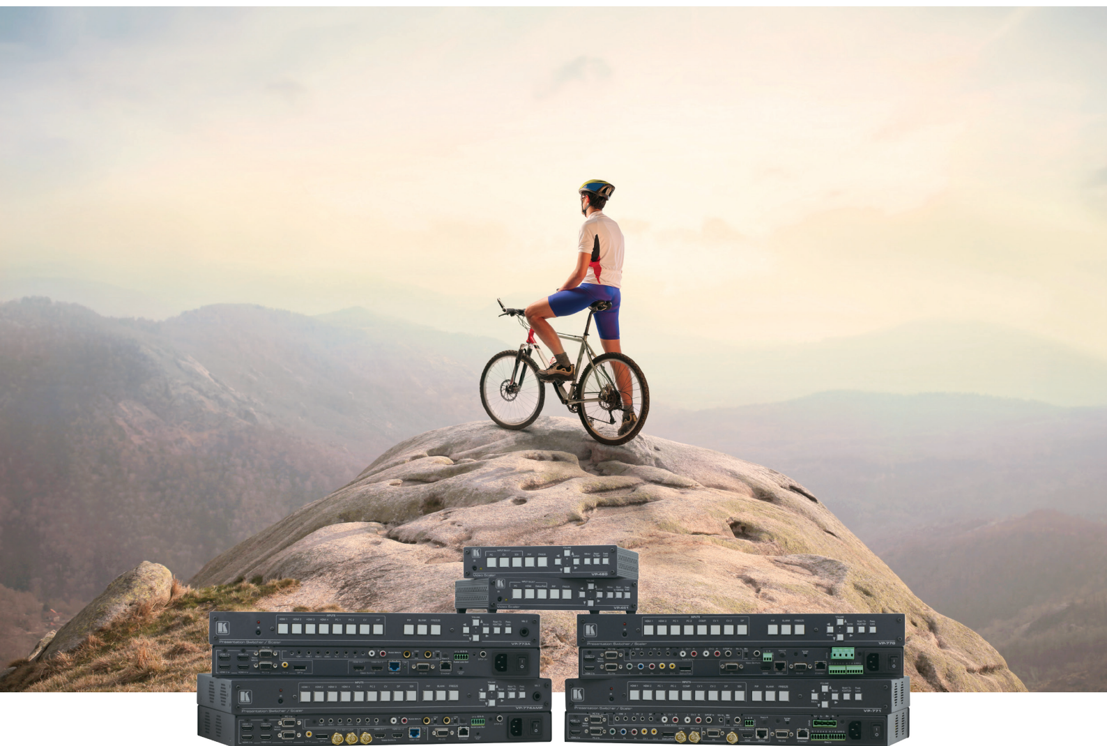
VP-460, VP-461, VP-770, VP-771, VP-773A, VP-774AMP